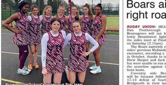
Bromsgrove School's imperious first team.

While an extra-time loss followed against King's Worcester in the final, after an 8-8 stalemate in the regulation period, Bromsgrove's girls were still qualified for the nationals as silver medalists.