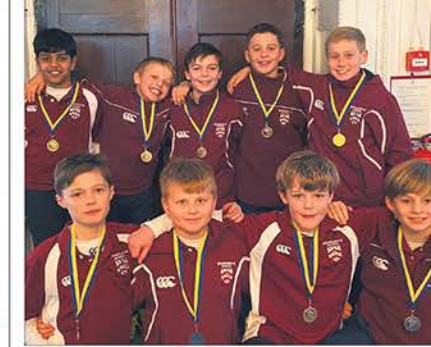
Bromsgrove's U11 boys team were unbeaten en route to a first-ever hockey title for the school in the tournament at Foremark Hall.

"I talked to their coach after the game and we both agreed that Ludlow had a fantastic defence, especially in the second half."