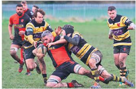
Newbold proved too tough for the Monners to handle in Saturday's Midlands One West clash.