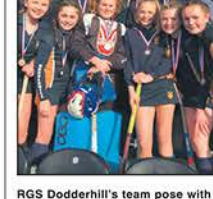
RGS Dodderhill's team pose with their bronze medals.