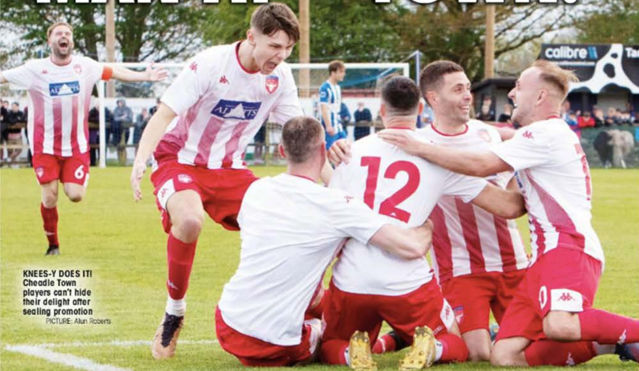
KNEES-Y DOES IT! Cheadle Town players can't hide their delight after securing promotion