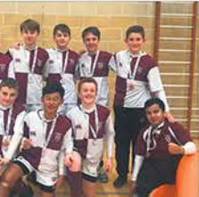
Bromsgrove are set to battle it out at the National IAPSL football finals.

required, as Bromsgrove converted two without reply. In reaching the semi-finals, Bromsgrove were awarded a place in next month's finals, something which perhaps removed some of the incentive in their clash with Cheltenham College. Cheltenham were 10-0 winners after scoring in the last seconds of the game. In the third and fourth place play-off, Bromsgrove said off Hazelgrove 1-0 to end the tournament on a positive note with the bronze medal. Bromsgrove will now do battle against the best in the country at Cheltenham College in the U13 finals on Friday, March 6.