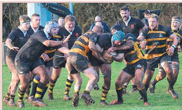
A Kiddersminster player attempts to drive through a couple of Droitwich players.